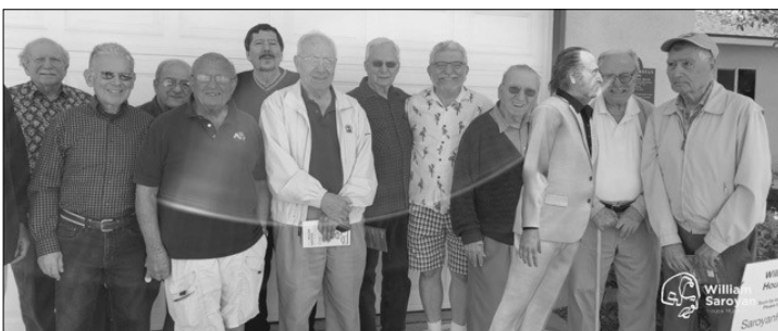
Visiting the William Saroyan House Museum