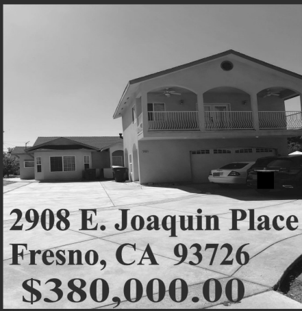
2908 E. Joaquin Place Fresno, CA 93726 $380,000.00

Daisy's Fragrant Kitchen ARMENIAN FOOD DONE RIGHT