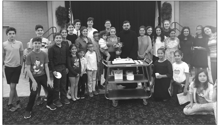
Sunday, October 13 - Priest Appreciation Day