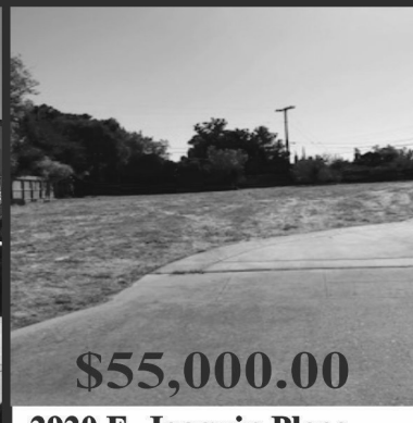
$55,000.00 2920 E. Joaquin Place (Build Another Home!)