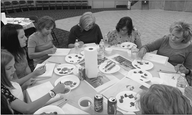
Saturday, October 12 - Paint Night