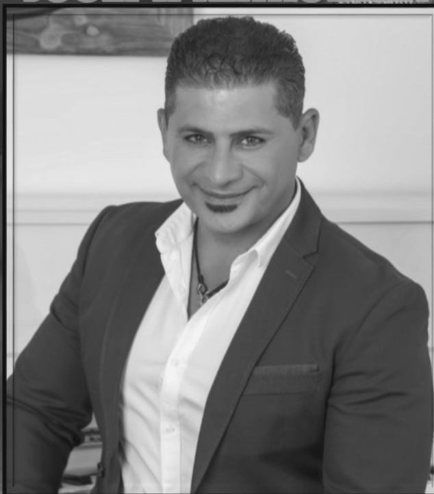
Armenian Pop Star